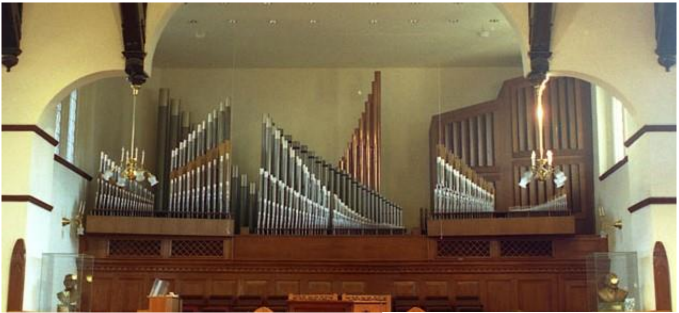
Featured – Fisk University Memorial Chapel