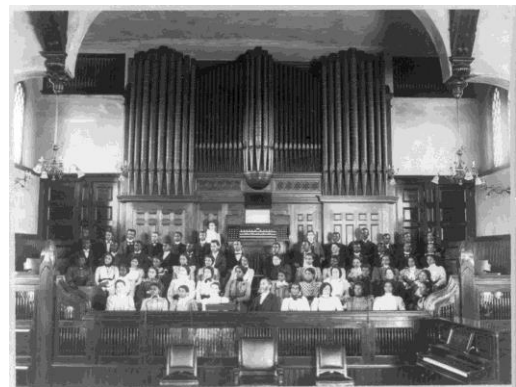
Fisk Memorial Chapel's original organ, 1897 Hook & Hastings, opus 1755. The organ built for the Tennessee Centennial Exhibition then installed at Fisk University